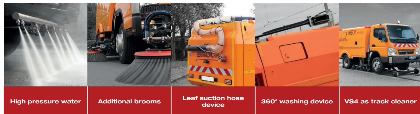
High pressure water

Thanks to our modular system, your machine becomes an unbeatable cleaning professional. Here you will find a small selection of possibilities: